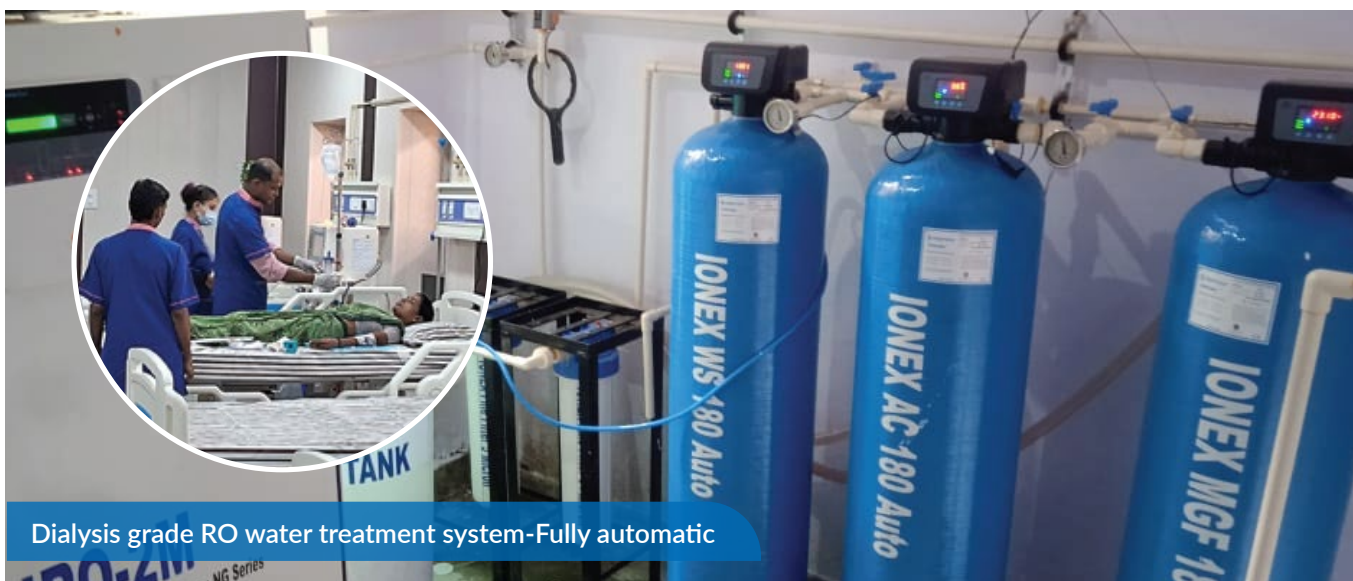
Dialysis grade RO water treatment system-Fully automatic